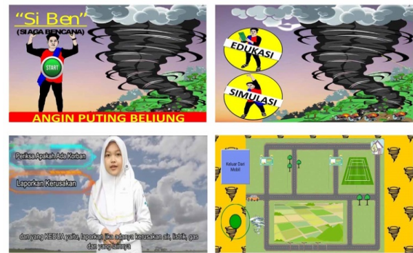
Figure 1. SiagaBencana (SiBen) Application

The model's result is a SiBen application based on android, as the output of method and media development for increasing the community's readiness to deal with hurricane disasters. The results of this study, first, the formation of the SiBen application, an Android-based game educational application. The minimum specification to run SiBen is Android version 5.0 with 60 MB of storage space.